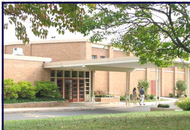
Pen Ryn welcomes you back!